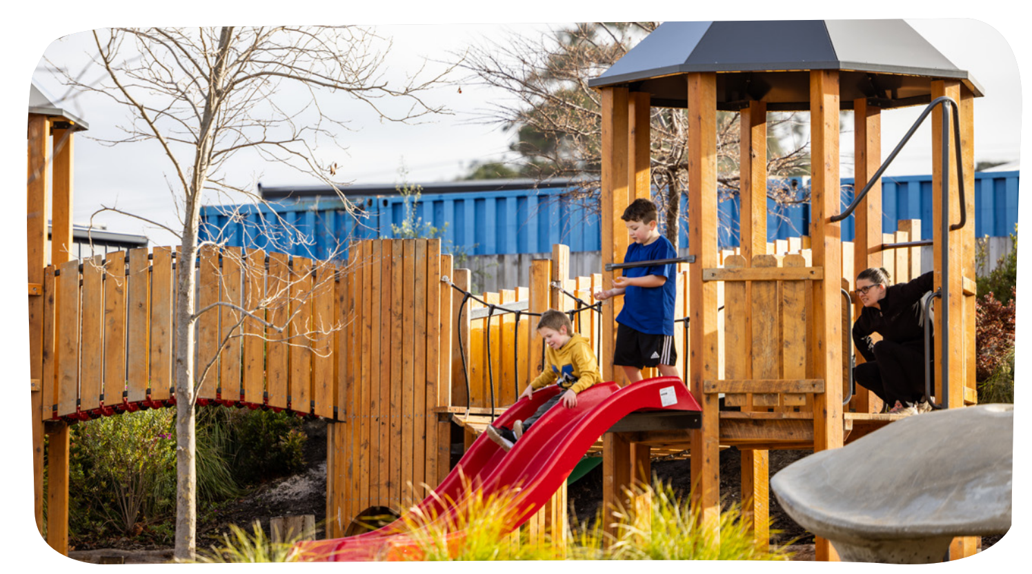
Owen at play with Tash close by.