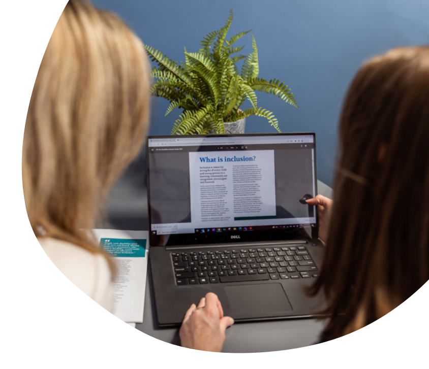
Educators engage with Be You resources.

"Having a safe space to remove children to, co-regulate with an educator or to provide opportunity to self-regulate, depending on what that child needs, is really important."